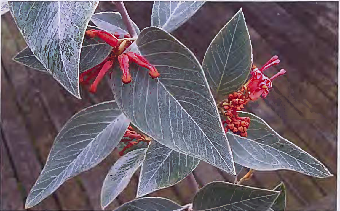
Figure 1. Grevillea burrowa , illustrating the subacute perianth limb face often found in plants sympatric with plants with an obtuse perianth limb face

The geographic and genetic isolation of the Burrowa Plateau population from other closely related taxa in niche habitats at higher elevations has resulted in G. burrowa being a relatively uniform entity with a distinctive suite of character states exhibiting some variation in the percentages of floral rachis branching and in the shape of the face of the floral limb between or within subpopulations. Grevillea burrowa is a biogeographically isolated and morphologically distinct taxon (see Fig. 2) represented by many thousands of individual plants. We recognise it here at species rank.